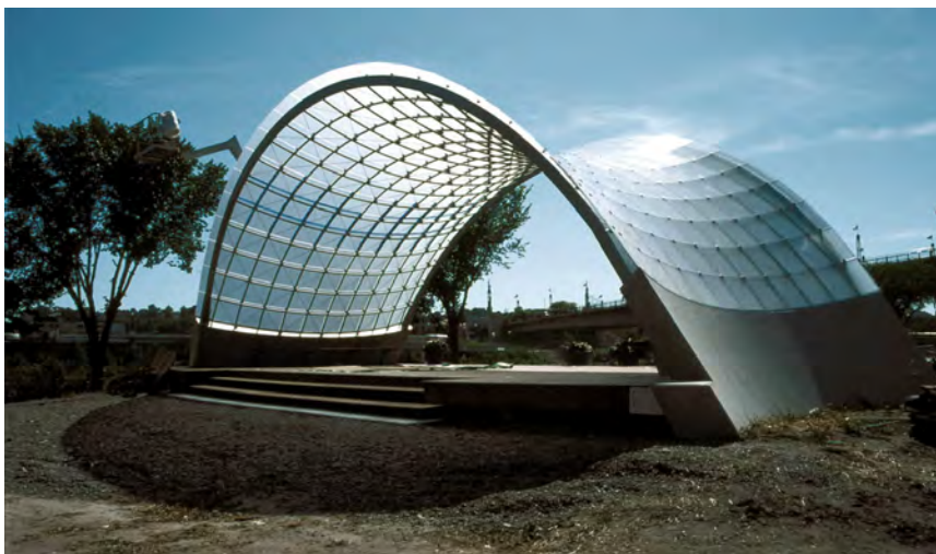
Figure 1: General view of Schubert Club Band Shell

The overall design was influenced by the surrounding area which is subject to flooding as well as deicing salts. This precluded the use of closed shapes and also meant that the structure needed to be corrosion resistant. Furthermore, it needed to have a robust base in order to resist impact from flood-borne debris. These factors, coupled with the desire to create a low-maintenance but architecturally significant structure, led the designers to choose stainless steel for the lattice. The Schubert Club hoped for a unique structure that would draw people to the island and establish the area as an important public venue.