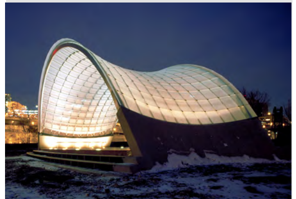
Figure 9: Night-time view of the Schubert Band Shell

Information for this case study was kindly provided by SOM LLP and TriPyramid Structures.