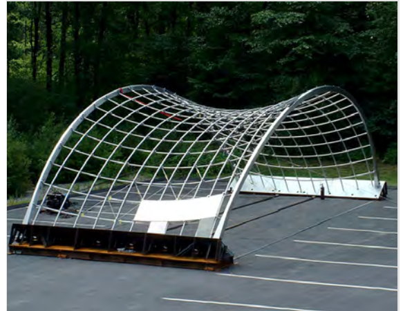
Figure 3: The Band Shell was first put assembled in the fabricators car park to ensure a good fit-up

The two lattice layers of pipes are joined at member crossings by thick posts which are 51 mm long, 34 mm in diameter and have a thickness of 8 mm. The posts are shop welded to the top layer and connected to the bottom layer by 12.5 mm through-bolts. An offset piece, which has a length of 19 mm, is welded to the top of each pipe in the top layer at member crossings. In addition, there is a layer of 8 mm diameter tension rod diagonals, which connect to the two layers of pipes, acting as bracing elements.