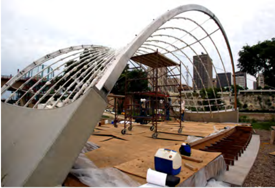
Figure 6: Installation of the curved edge beams and lattice members

Each offset piece houses a through-bolt and receives a glass patch plate connection. The glass panels themselves were not designed to be load-bearing. The diagonal bracing elements are grade 1.4301 stainless steel rods with a yield strength of 758 \text{ N/mm}^2 , and are connected to the posts by machined split rings that fit around the posts. They are arranged in a “union-jack” pattern, with four diagonals forming a full ‘X’ over four structural panels. A continuous curved 13 mm thick plate acts as an interface between the lattice and each precast abutment. This plate was provided to the concrete contractor by the stainless steel component specialist, which meant that it could be used to help control the positions of the lattice connections. The alternative of placing an embedment for each lattice end connection at the pre-casting plant would certainly have resulted in misplacement of the end connections.