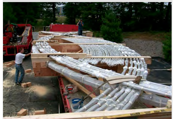
Figure 4: Curved members ready to be delivered to site