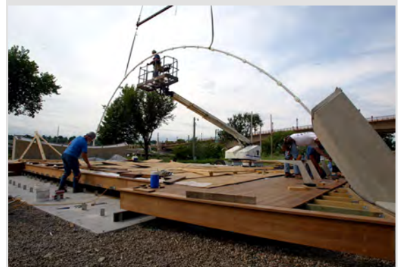
Figure 5: Installation of the first curved member