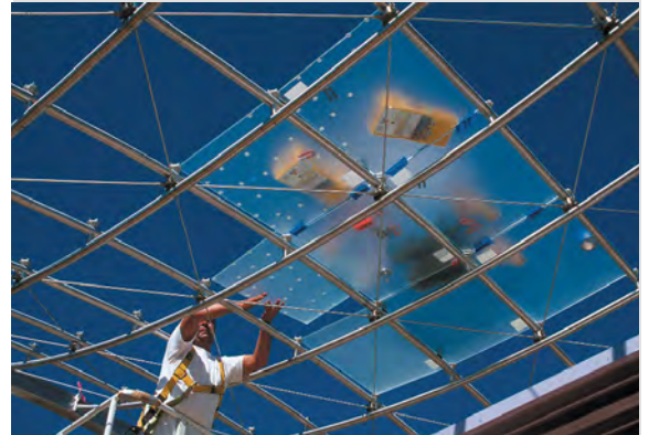
Figure 8: Placement of the glass panels

Almost ten years after the Schubert Club Band Shell was constructed, there are no signs of staining or decolourisation. There has been some graffiti left on the abutments but this was washed off. The structure won the American Institute of Steel Construction Engineering Award of Excellence in 2004 as well as the National Council of Structural Engineers Association Excellence in Structural Engineering Award of Merit in 2004.