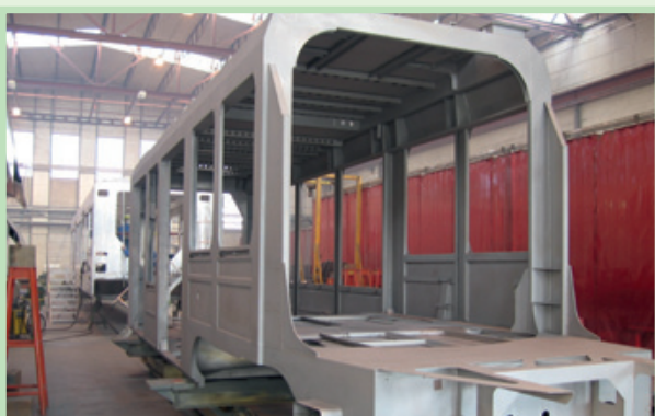
Fabrication of Tango light rail carriages in the workshop