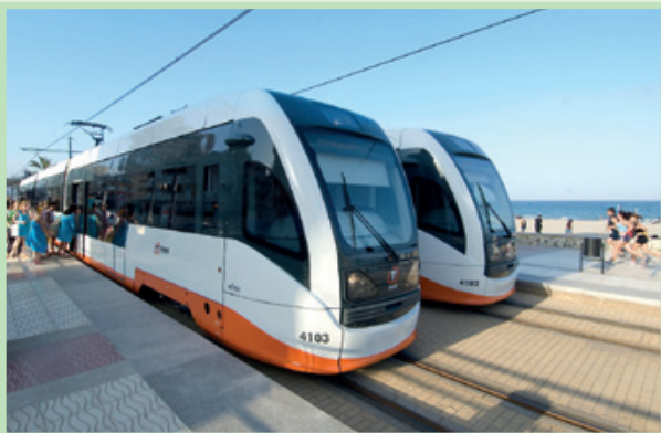
Train-tram stop next to Alicante beach

Because of its inherent strength, stainless steel can be thinner, and therefore lighter, than other materials while retaining its operational integrity. Vossloh España took this feature into account during the design of the train-tram.