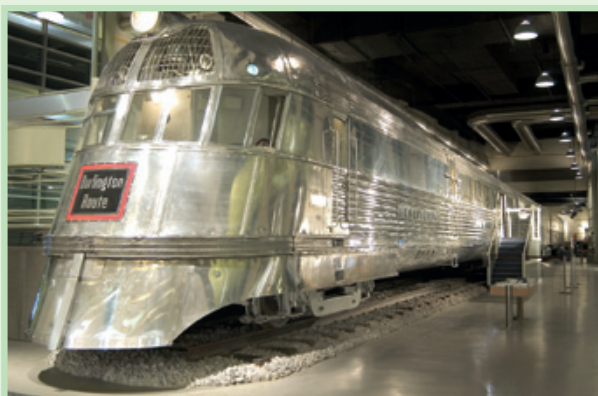
Pioneer Zephyr train, USA, 1934

Stainless steel was first introduced in 1912. By 1932 the first railcars to utilise an all-stainless design had been put into service by the Budd Company in Canada's Rocky Mountains. The extreme temperatures and operating conditions in the Rockies enabled stainless to show off its superior technical properties and exceptional suitability for rail applications. Other rail companies soon followed suit, introducing stainless steel railcars on their routes.