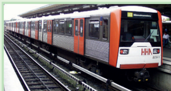
Positive long-term experience with the DT-3 ensured Hamburger Hochbahn opted for stainless steel in its next generation of trains

“The removal of graffiti accounts for a considerable percentage of the body maintenance cost,” Petersen adds. Chemically dissolving graffiti on painted surfaces degrades the coatings over time. Graffiti does not adhere well to polished and