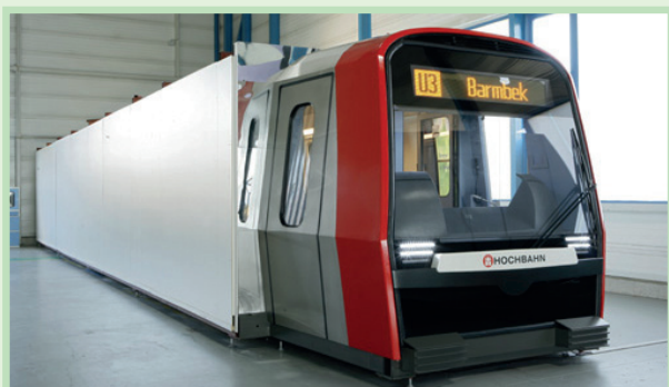
Mock-up of the next generation of Hamburg's metro cars

brushed stainless steel making its removal easier. The absence of a coating also means that the blank metallic surface does not undergo any colour changes due to UV-radiation. Repainting faded surfaces is a thing of the past.