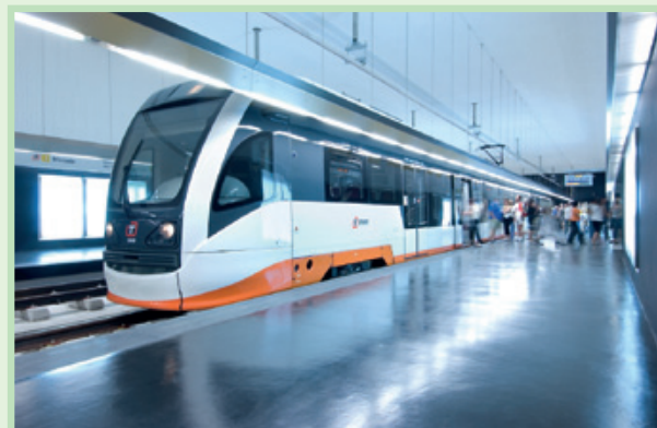
Train-tram station in Alicante

Identifying the optimum materials mix was important to meet targets for passenger safety and low fuel consumption (and therefore low emissions). The materials selected had to be as thin and light as possible while ensuring they could fulfil their operational roles.