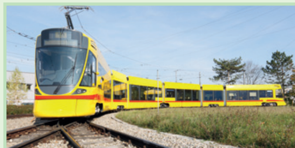
Tango light rail

"We made a very conscious choice for this material, because it is very well established within rail vehicle construction. The Basel track conditions, with their great gradients and extremely narrow curves, place the highest demands on construction and material. Streetcars which function well here function well everywhere in the world," states Jürgen Ruess of Stadler Quality Management, the company that will build a total of 60 new Tango vehicles in the coming years for the Basel Transit Authority and Basel Transport AG.