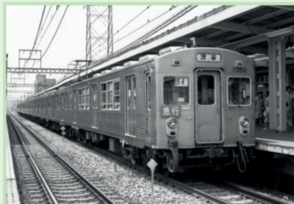
Japan's first all-stainless steel railcar (Tokyu's 7000-series)

Until the 1980s carbon steel was a popular choice for railcars due to its lower initial cost. However, extra manufacturing processes such as coating and shape-correction have increased both the initial cost and repair and maintenance charges.