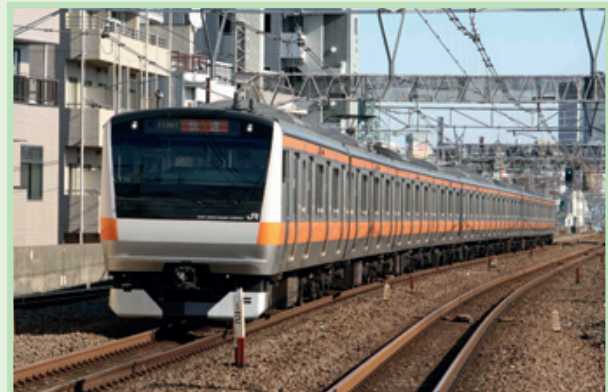
Recent stainless steel commuter train (JR East Japan's E233)

The cost of building a stainless steel railcar has been substantially lowered since the first models came into service in the 1950s. The wider use of robotics and automated processes mean that stainless railcars are often cheaper than their carbon steel counterparts.