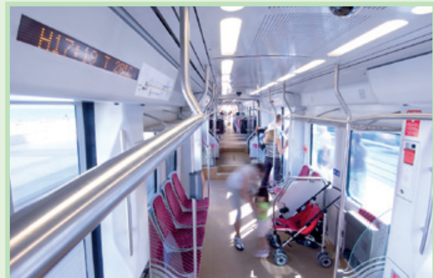
Train-tram interiors

Stainless steel offers reductions in cost, weight and energy use. These properties are essential for the success of stainless in rail transport and to ensure the sustainable growth of the railroad industry.